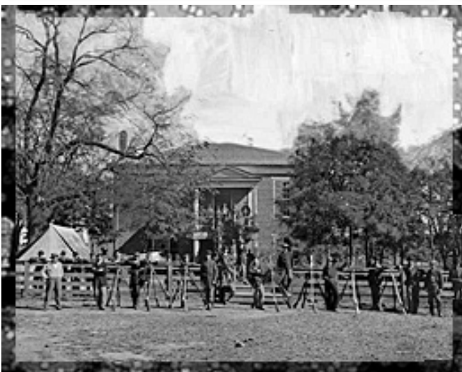
Original Appomattox Court House