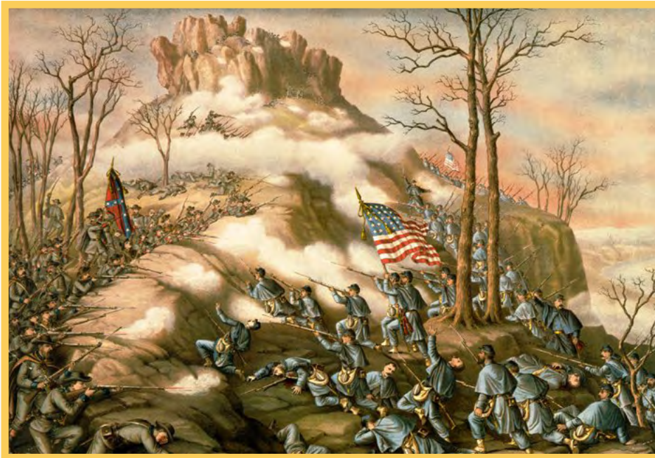
“The Battle Above the Clouds” Lookout Mountain - Chattanooga, TN